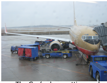
The Gee's plane getting ready to leave.