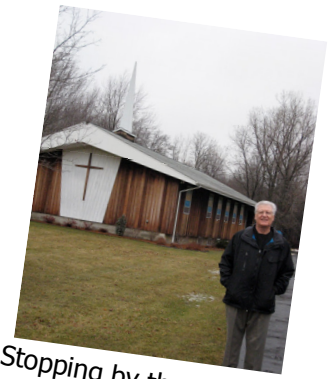
Stopping by the church on the way to the airport