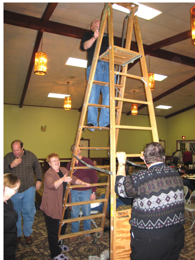
Technical difficulty with the projector