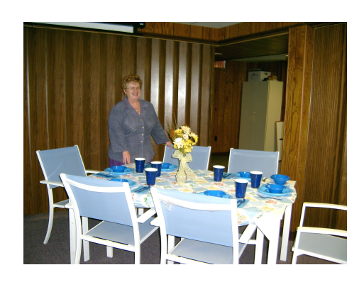
GOOD FRIDAY SERVICE