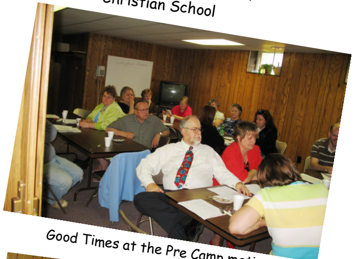
Good Times at the Pre Camp meeting