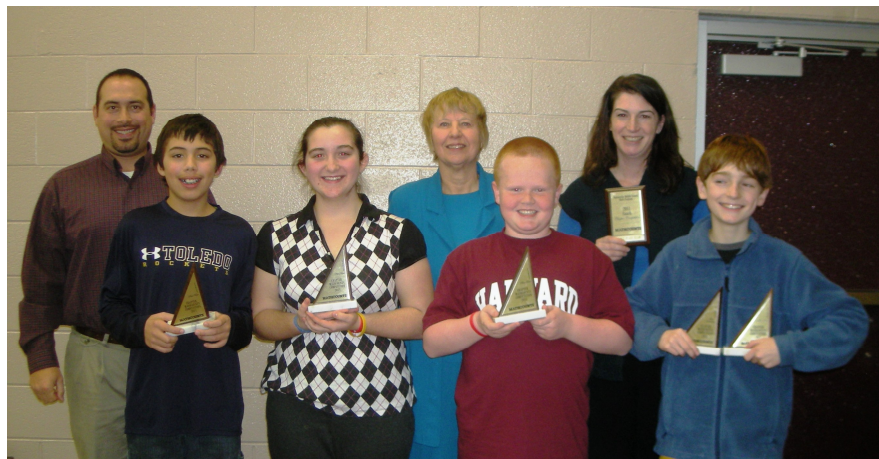
MATH COUNTS! WINNERS