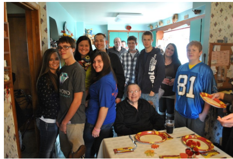
Most of the Begeman clan Thanksgiving