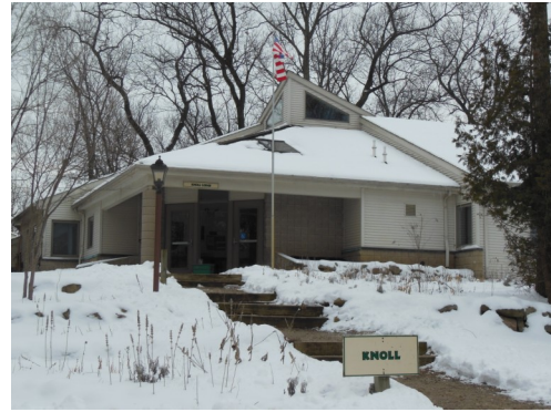
Knoll Lodge, the new place at Howell Nature Center