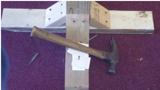
OUR CARES AND CONCERNS NAILED TO THE FOOT OF THE CROSS