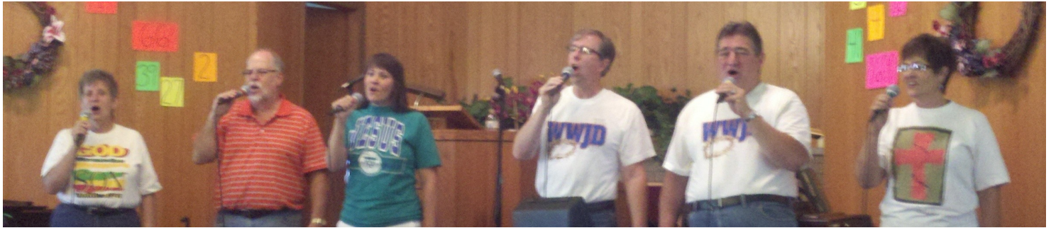
The Echoes gave an impromptu concert for us.